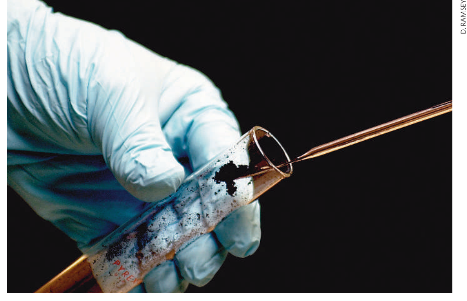
Potential health risks from exposure to engineered nanomaterials must be understood and minimized.

As research leaders in our respective fields, we recognize that systematic risk research is needed if emerging nano-industries are to thrive. We cannot set the international research agenda on our own, but we can inspire the scientific community — including government, industry, academia and other stakeholders — to move in the right direction. So we propose five